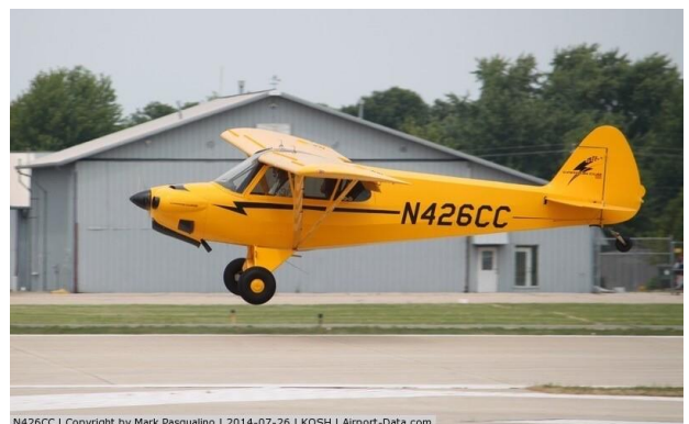
N426CC | | 2014-07-26 | KOSH